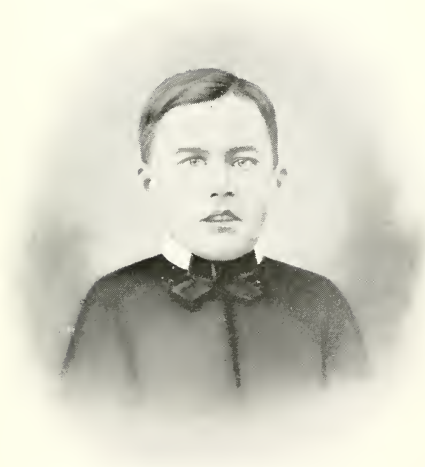
THE AUTHOR, IN BOYHOOD.